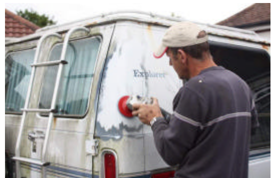
As if by magic !!

We are planning to take Polly to the Nationals in Ipswich in August however a lot of work is still required. A lot of the rust has been removed and repaired on one side so now the other side needs the same treatment. Bonnet and other places have been repaired and of course that horrible green mossy stuff has been completely washed and polished away. A new carpet has been fitted through out and wood panels have been rubbed down and re-varnished. Other bits and pieces to be done and then to be put through an MOT. Fingers crossed she passes. Will keep you updated on the progress.