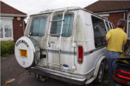
Arriving at her new home