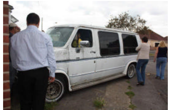
A warm welcome by all