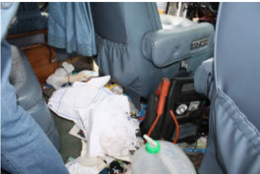
Full of rubbish.....